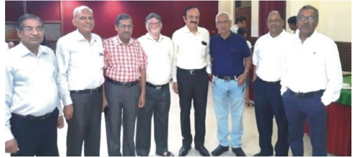
Members of Ghaziabad Local Chapter at Get-to-gather

The members of Ghaziabad local chapter along with their spouses had a get-to-gather in the evening of August 11, 2018 at Kavi Nagar. Around 40 members with their spouses were present.