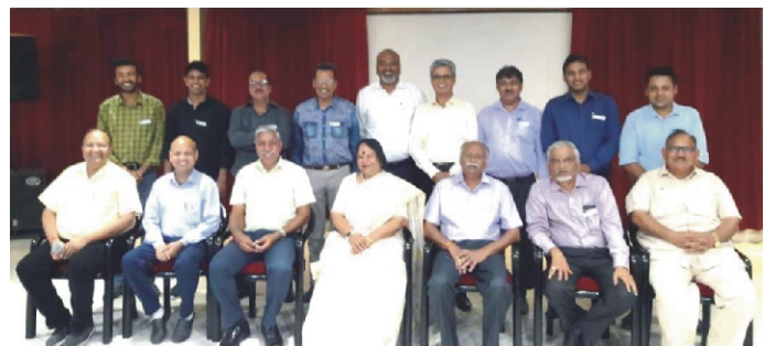
Members of Jaipur Local Chapter at Chapter formation meet