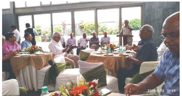
Gathering of members at Meerut Local Chapter