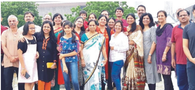
Ahmedabad Chapter Family Get-together on 19th Aug 2018